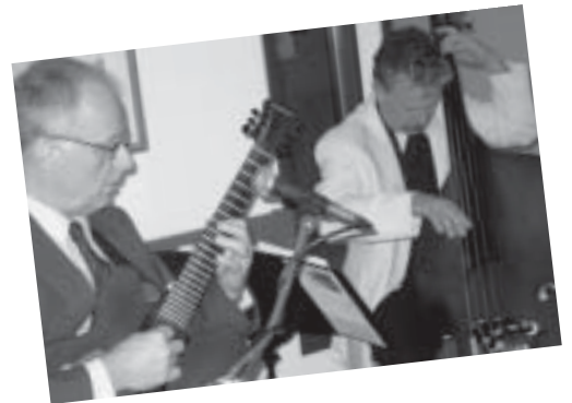
Sapphire Blue Jazz performs